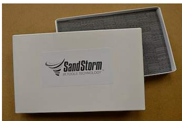
IR ¾sq Packed Box