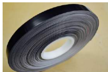
IR 300' Roll