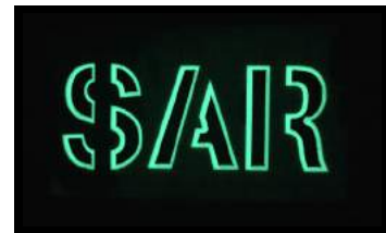
View with Naked Eye