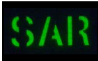
View with Night Vision